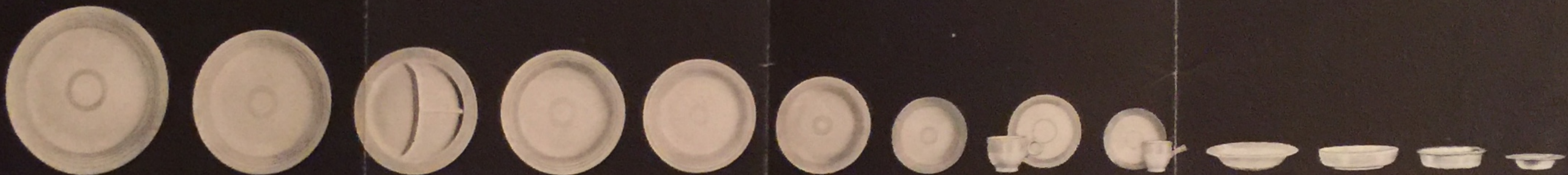
CHOP PLATE 15" CHOP PLATE 13" COMPARTMENT PLATE 10 1/4" PLATE 10" PLATE 9" PLATE 7" PLATE 6" TEA CUP & SAUCER COFFEE CUP & SAUCER A. D. DEEP PLATE 8" DESSERT 6" FRUIT 5" ASH TRAY