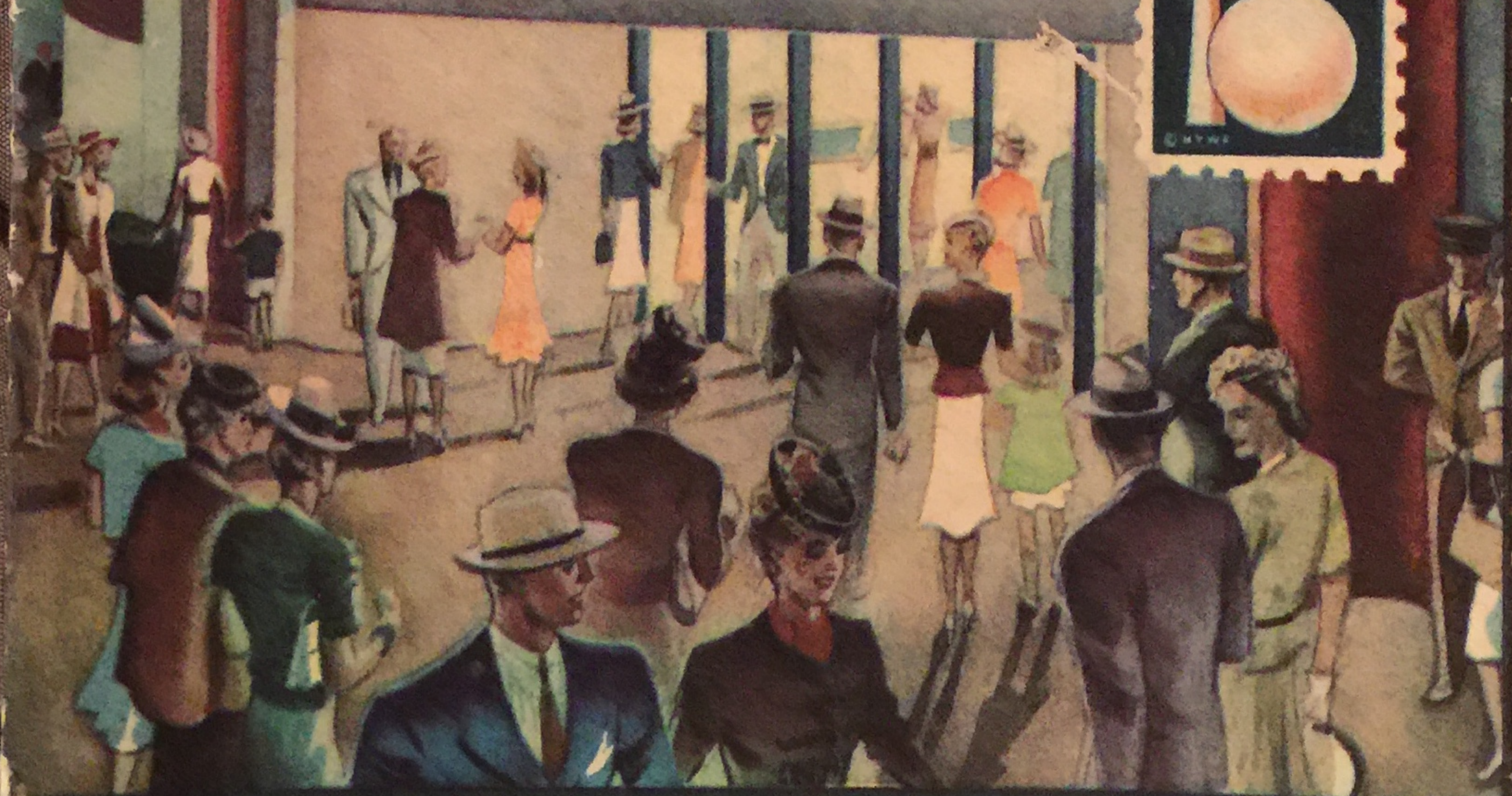
HEINZ EXHIBIT · 1939 NEW YORK WORLD'S FAIR